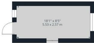
Floor 0 Building 2

Approximate total area (1) 1180.59 ft 2 109.68 m 2