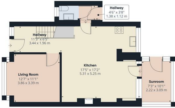
Floor 0 Building 1